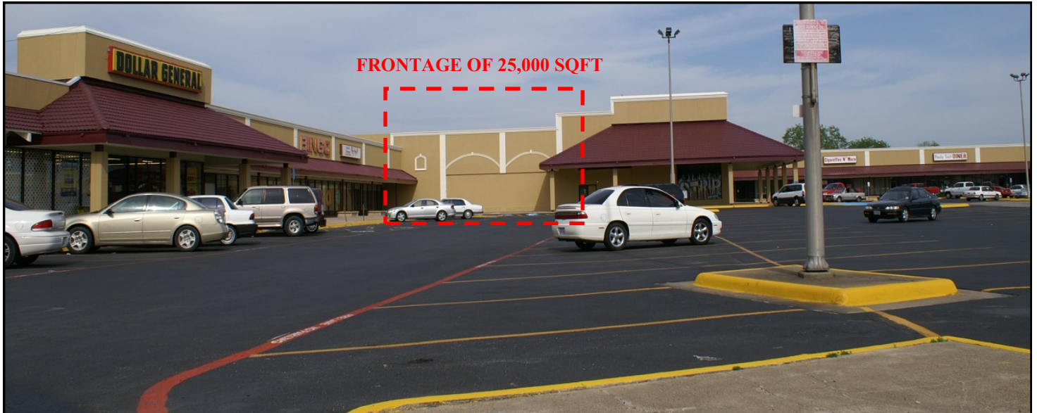
LAKE JUNE-HICKORY TREE PLAZA 11903 Lake June Rd., Balch Springs, Tx 75180

25,000 Sqft RETAIL ANCHOR 600 Yards from Super Wal-Mart