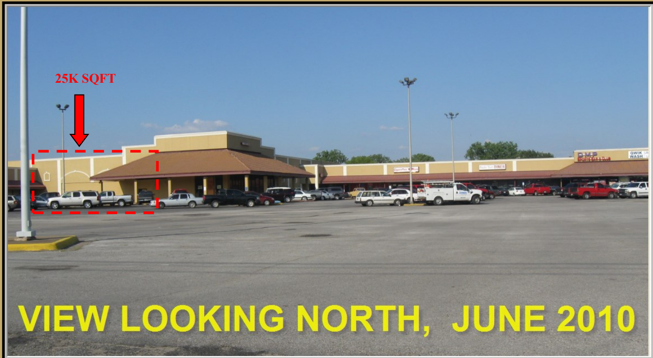
VIEW LOOKING NORTH, JUNE 2010