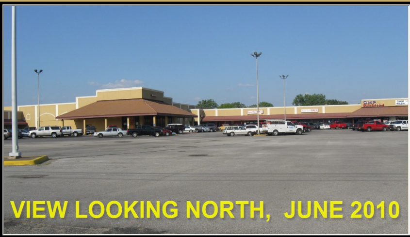
VIEW LOOKING NORTH, JUNE 2010